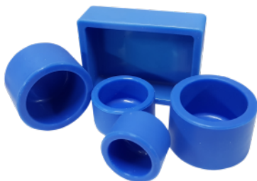
Silicone Mold Cups