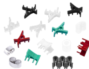
Sample Support Clip